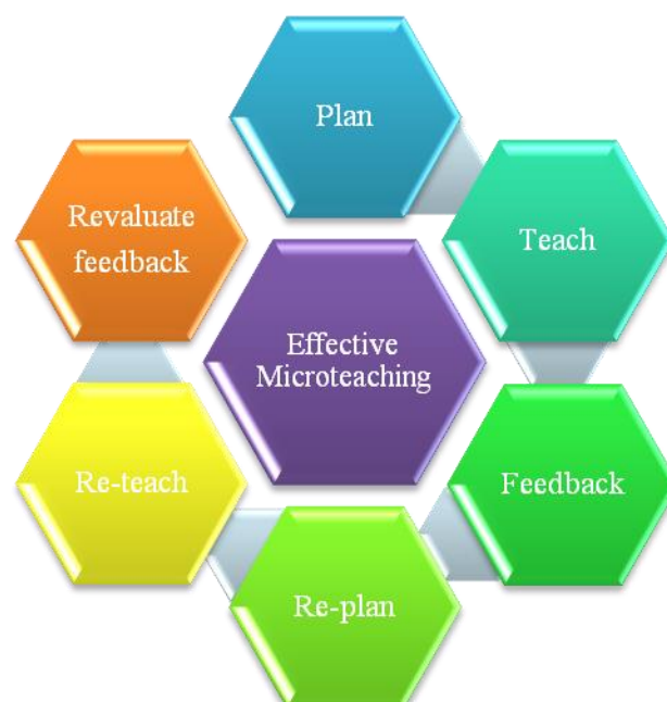
Figure 2: Key Components of Microteaching