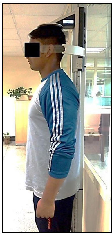
Figure 1: Height Measurement by Stadiometer