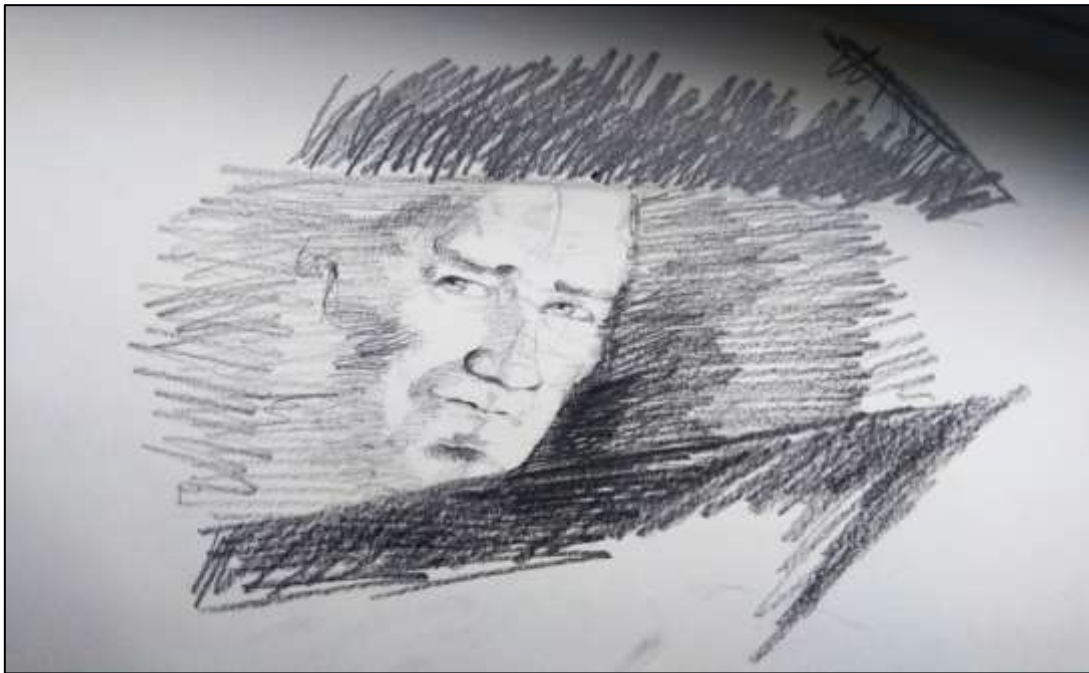
Figure 1: The drawing of the concept of “Atatürk”

The drawing of the concept of “Atatürk” based on the metaphors of the students is shown in Figure 1.