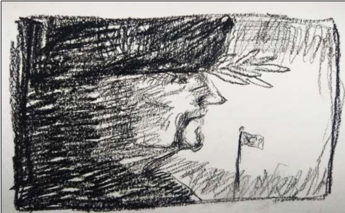
Figure 2: Drawing to the concept of “War of Independence”

The third and last sub-question of the research is “What are the metaphorical perceptions of the fourth grade students in primary school on Republic?”, and the metaphors given by the students for this sub-question are shown in Table 5.