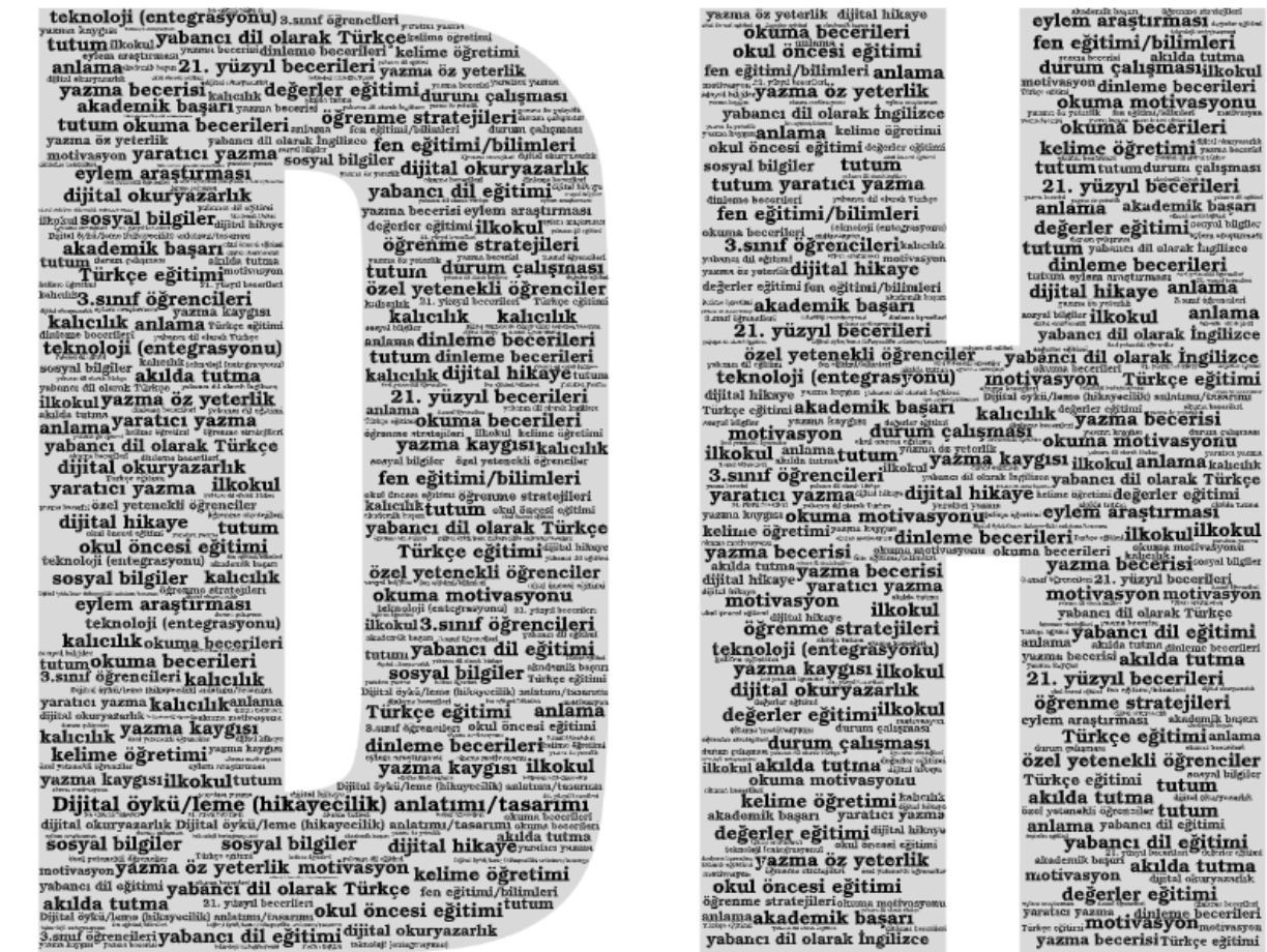
Figure 3: Word cloud created with the key words