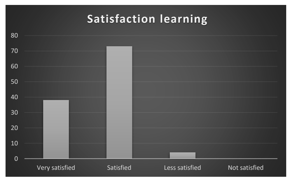
Graph 1: Analysis Results per Individual BL-M for Indonesian Students

The results of the data from the five aspects of satisfaction in the BL-M (tangibles, responsiveness, reliability, empathy, and assurance), the majority of students were satisfied with the BL-M lecture from a total of 115 respondents, a total of 73 are happy with the BL-M, 38 are very satisfied, and four respondents aren't satisfied with the BL-M. The average SS in the category is confident with the BL-M. This condition is by the facts in learning during the CV-19-P or after the CV-19-P in certain areas in Indonesia.