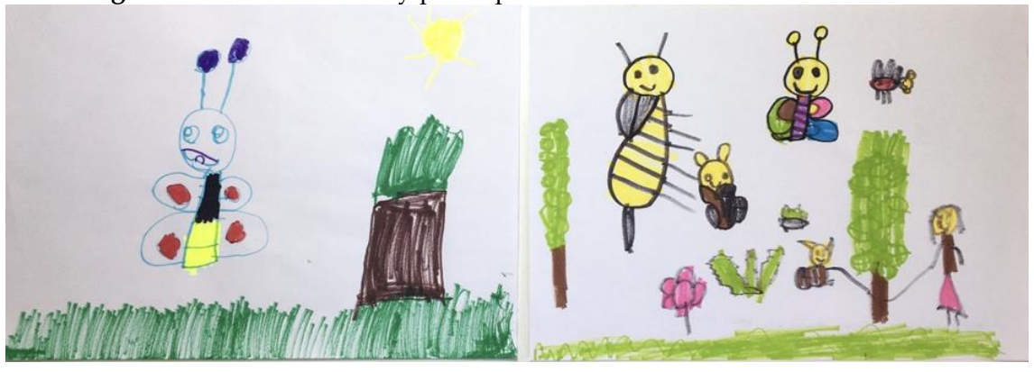
Figure 2: Pictures drawn by participants P4 and P11 in the second session

"Animals are walking in the forest." (P13)