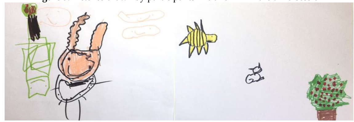
Figure 3: Pictures drawn by participants P10 and P12 in the third session

Below are examples of the participants' explanations of their pictures.