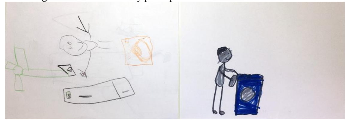
Figure 6: Pictures drawn by participants P10 and P12 in the sixth session

Table 10: Analysis of pictures made at the end of the seventh session