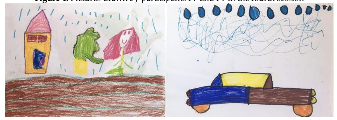
Figure 4: Pictures drawn by participants P7 and P9 in the fourth session