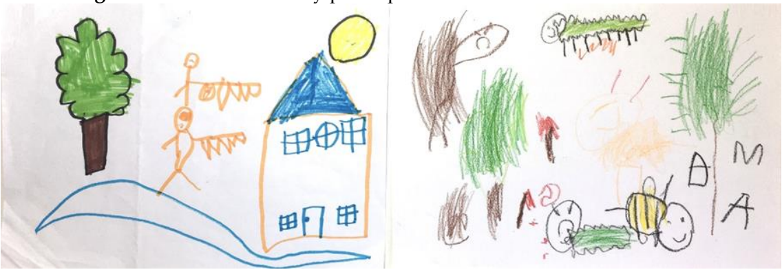
Figure 1: Pictures drawn by participants P13 and P9 in the first session

Table 5: Analysis of pictures made at the end of the second session