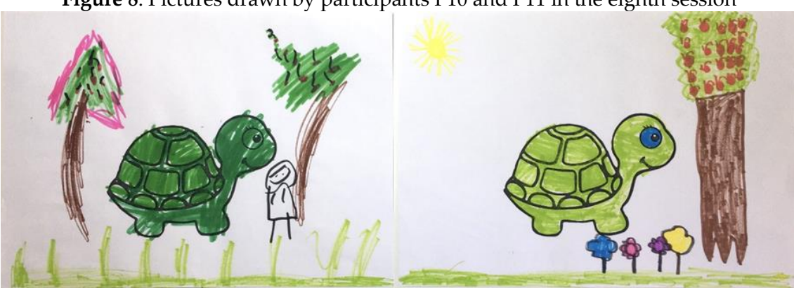
Figure 8: Pictures drawn by participants P10 and P11 in the eighth session