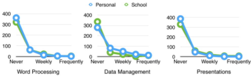
Figure 3: Differences in personal and school-related productivity usage by students

smartphone applications, not computers. Most smartphone applications were related to digital chat, social networking services, and entertainment. For productivity, there was little difference in the number of answers between personal and school-related usage, both being very low in usage. Therefore, both numbers were compiled into a larger data pool to calculate the percentages. Productivity showed all categories, with over 70% of students never using ICT for productivity purposes. A particular area of interest is that, during the observation period, students were given English presentation assignments and were encouraged to use the Internet for research and print any supplementary materials for extra credit. Despite the incentive, 83% of the students responded that they had never used ICT for presentations. An explanation for this could be possibly found in the parent interviews later discussed. Figure 3 shows the number of students per answer for productivity between personal and school-related usage. Details for productivity can be seen in Figure 4.