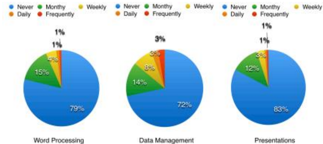
Figure 4: Productivity usage breakdown for students