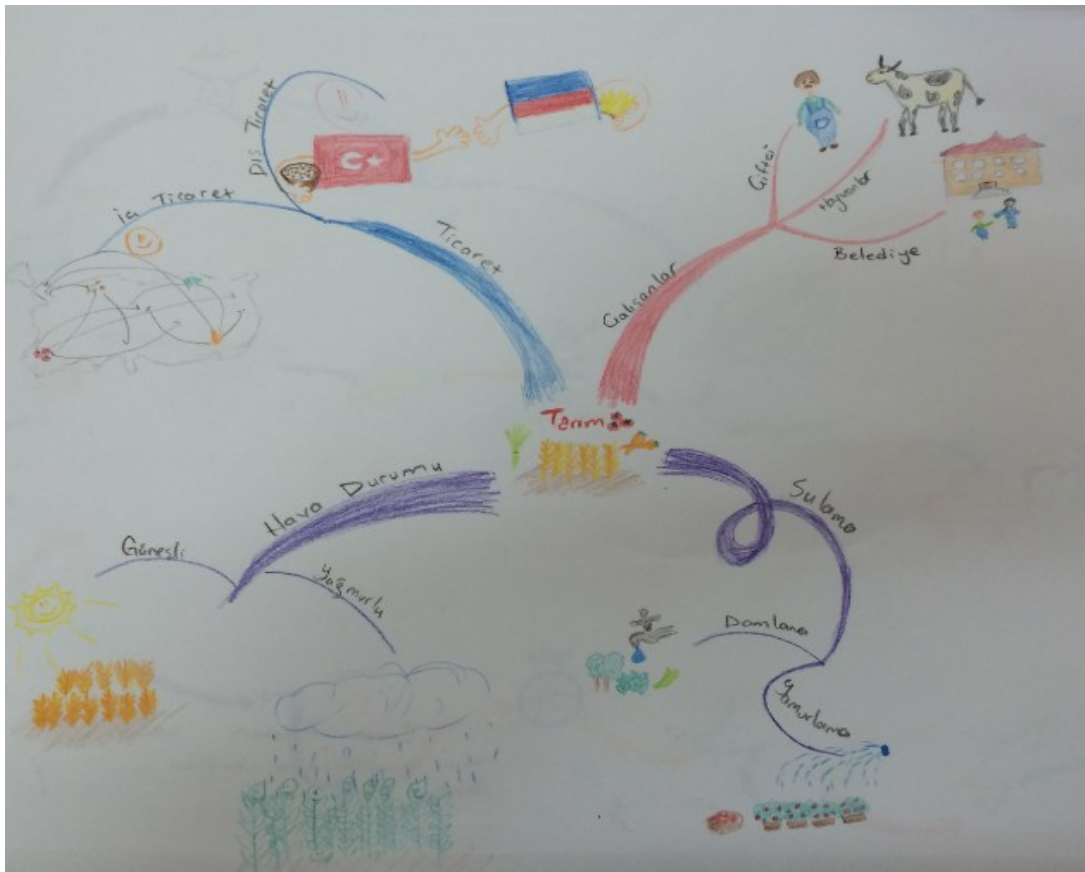
Figure 3: Examples of preservice teachers' images