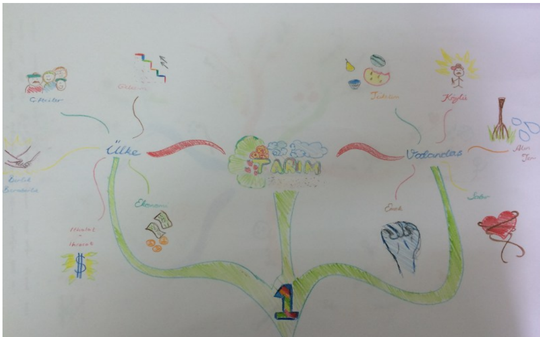
Figure 4: Examples of preservice teachers' images