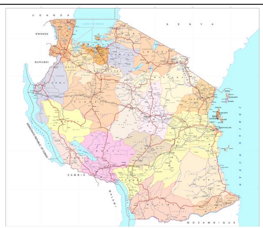
Map: The United Republic of Tanzania

As for the language, the official website of Tanzanian website is shown in two languages, namely, Kiswahili and English. Kiswahili is the national language and is regarded as the united language for people between ethnics to communicate. Both Kiswahili and English are the official languages, while the former is the medium of instruction at primary school level, social and political spheres; the latter is the medium at higher educational levels, technology, and higher courts. English serves the purpose of providing Tanzanians with the ability to participate in the global economy and culture. Virtually all of Tanzania's inhabitants speak Bantu languages. Among the 158 ethnic groups, there are Bantu, Nilotic, Khoikhoi and Cushitic speakers.