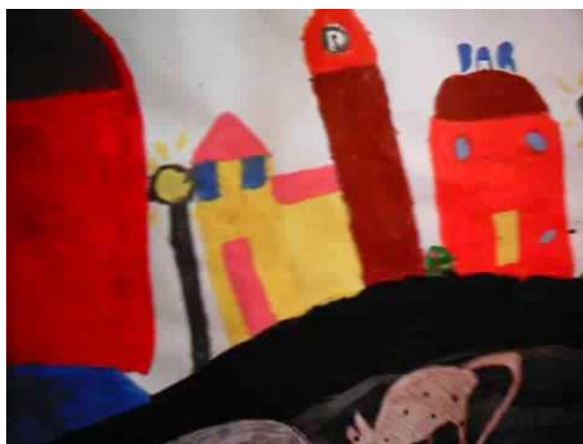
Figure 15: The Pied Piper of Hamelin , 2009

The students of the school also embarked on an innovative activity, producing a trilingual video The Pied Piper of Hamelin . The puppets were made in the UK, the music was composed by the Thessaloniki Music School, and the puppet performance took place in Italy (Figure 15).