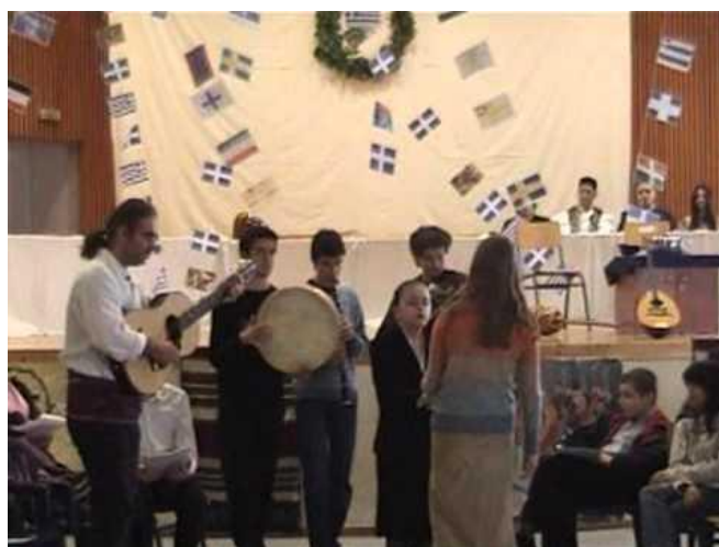
Figure 13: The song of Karaiskaki, Music School of Thessaloniki, Music Library, 2005

Original compositions such as songs for school events were produced, songs about the heroes of 1821, Kolokotronis, Karaiskakis, Papaflessas, Bouboulina, Athanasios Diakos and others, songs about the Macedonian Freedom Fighters of 1912, about Asia Minor and the Pontus region of the Black Sea, songs about peace and many others. Blind students participated (Figure 13).