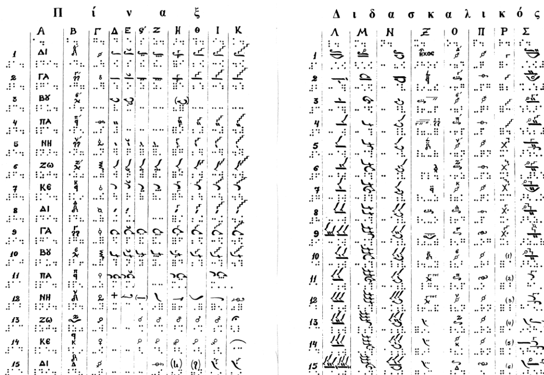
Figure 11: Chart of all the 6dot Braille symbols of Byzantine Notation according to Fr Dositheus method

Apart from Chryssafides' method of transferring Byzantine chant music notation into the Braille system; there is Father Dossitheus' method. His name as a layman was Pantelis Paraskevaïdis. In 1929 he went to the Holy Mountain, where he became a monk and was given the name Dositheos. Dositheos approached the issue of writing Byzantine music in braille differently from Chryssafides. According to this method all the Byzantine music characters are transferred separately and directly to the Braille system without any connection with the worldwide international Braille music code (Figure 11).