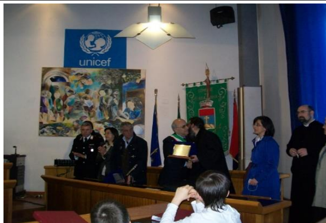
Figure 12: Etwinning Digital Music Library project, awarded in Ferrandina, Italy 2010

The results of the applications of our eTwinning project were presented at the Greek Ministry of Education, at educational meetings, conferences and in the Press. The eTwinning music library, that was created includes theoretical texts and scholarly articles on music, Choral works by Greek and European composers, voice exercises, arias and scales mostly from Italian opera, traditional Greek music, chanting and traditional songs in braille, modern European composers and compositions by teachers, students and alumni of the school.