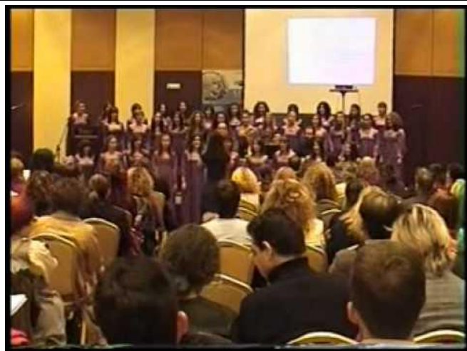
Figure 16: First presentation of eTwinning Hymn, Thessaloniki 2009

This hymn has to date been translated into several different languages and presented in different editions by 21 schools. Most important versions are by the Thessaloniki Music School choir under the direction of Angeliki Krisila with piano accompaniment, the children's choir from Southwater Infant School in the UK, with a percussion ensemble, a traditional performance on the banjo in Greece and Turkey, a performance on the church organ and choir in Ferrandina Italy (Figure 17).