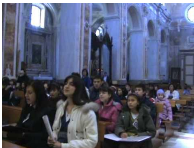
Figure 17: Etwinning Hymn played with an orgel in Ferrandina Church-Italy, 2010