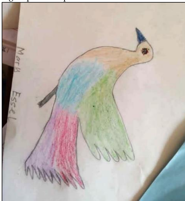
Figure 10: Imaginative Representation of Pigeon Produced by a Basic Two Hearing-Impaired Pupil of Tetteh Ocloo State School for the Deaf

The papercraft, as observed in Figure 9, was produced by a hearing-impaired girl labelled as respondent 7. She is an eleven (11) year old basic three hearing-impaired pupil of Tetteh Ocloo State School for the Deaf. In one of the Visual Arts' practical sessions, as observed by the study, the hearing-impaired pupil-respondent 7 creatively cut out a green manila card into four human figurative shapes. The pupil-artist interpreted the papercraft (Figure 9) as the memorable occasion of her 11th birthday where she (the hearing-impaired pupil-respondent 7) together with her friends had lined up, holding hands and joyously singing birthday songs amidst merriment. According to the hearing-impaired pupil-artist, she decided to write her name (Ampong Elizabeth) on both legs of her image (as observed in Figure 9) to distinguish her from her friends.