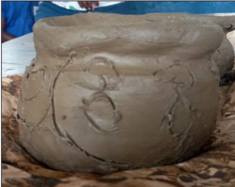
Figure 8: A Pottery Ware Produced a Basic Six Hearing-Impaired Pupil of Tetteh Ocloo State School for the Deaf