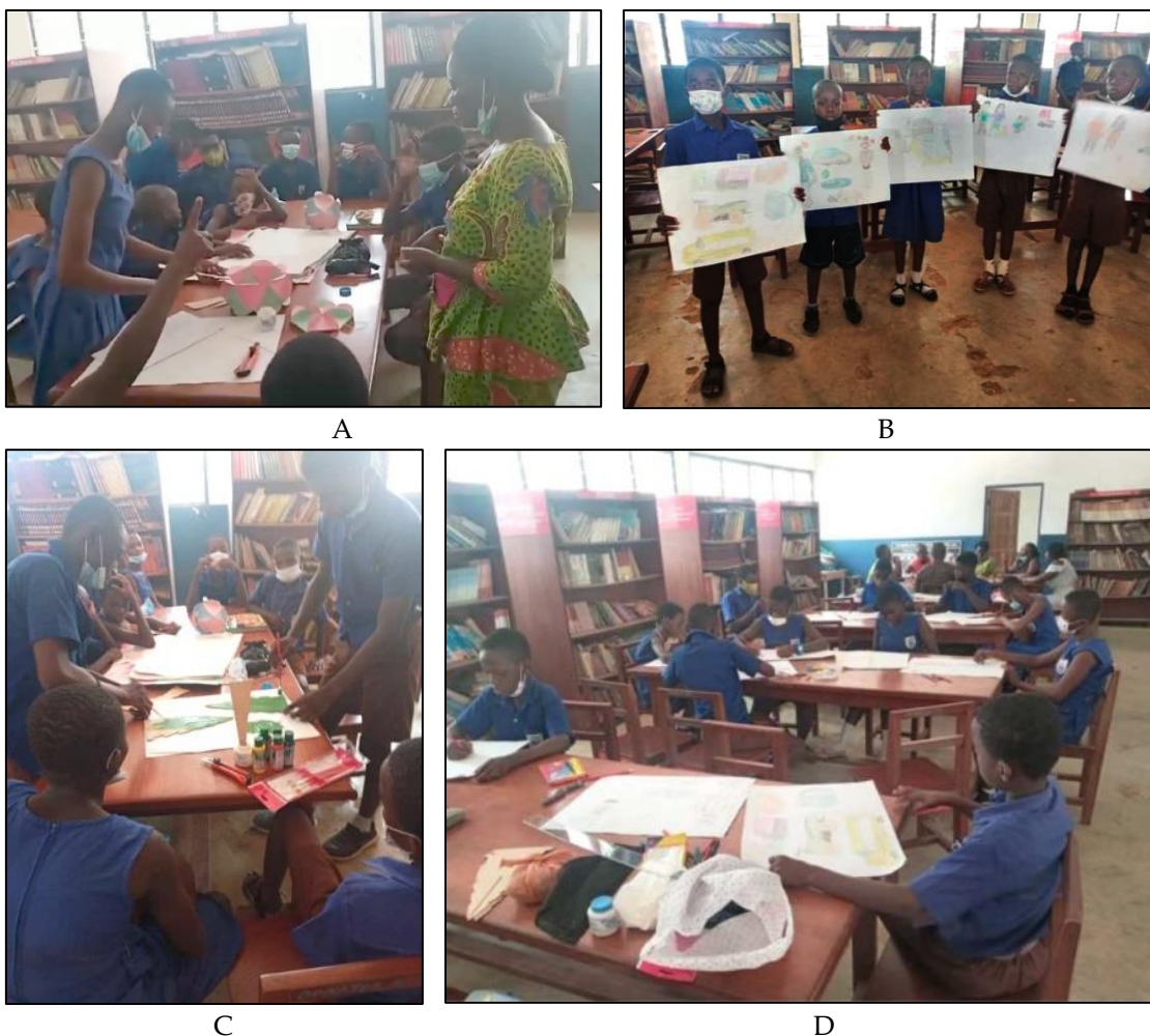
Figure 2 (A, B, C & D): Visual Arts Practical Sessions in Tetteh Ocloo State School for the Deaf

This notwithstanding, the Headteacher together with the three Creative Arts teachers listed several challenges confronting the teaching and learning of the Visual Arts component of the Creative Arts subject in Tetteh Ocloo State School for the Deaf. These included but not limited to: lack of Art studio; inadequate provision of art-based equipment, tools and materials; inadequate Art specialist teachers; inadequate time allocation; lack of funds to organise educational trips and many others. The teachers opined that the holistic resolution of the aforementioned challenges by the government of Ghana or Non-Governmental Organisations, institutions and philanthropists, would lead to more efficient and effective teaching and learning of the Visual Arts component of the Creative Arts subject in Tetteh Ocloo State School for the Deaf.