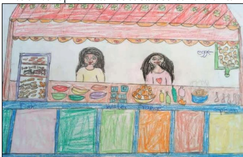
Figure 3: A Colourful Composition Produced by a Basic Five Pupil of Tetteh Ocloo State School for the Deaf

of the teaching and learning of the Visual Arts component of the Creative Arts subject, the study ascertained that the hearing-impaired pupils of Tetteh Ocloo State School for the Deaf did participate in all the practical sessions with a high sense of enthusiasm. The hearing-impaired pupils under the tutelage of their Art specialist teachers did produce intriguing visual artefacts worthy of appreciation. Some of these intriguing visual artefacts produced by the hearing-impaired pupils of Tetteh Ocloo State School for the Deaf represent the oral accounts of their worldview of salient experiences in their social and physical environments as herein appreciated.