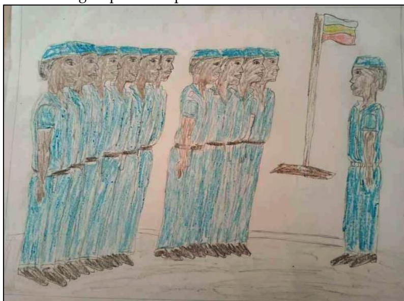
Figure 5: A Monochromatic Composition of Corps’ Parade Produced by a Basic Four Hearing-impaired Pupil of Tetteh Ocloo State School for the Deaf

played on. According to the hearing-impaired pupil-respondent 1 (personal communication, September 20, 2021), “my drawing is about how my siblings maltreat me at home. Because they can hear and speak and I cannot, they do not allow me to play with them. My mother will talk and warn them but they do not allow me”. The pupil’s interpretation of her work (Figure 4) represents what she goes through in her immediate social environment which is in tandem with child art being reflective of children’s world of experiences (Lowenfeld, 1947; 1964; Lowenfeld & Brtittain, 1987; Farokhi & Hashemi, 2011; Lowenfeld & Brtittain, 1987; Kayacan-Keser and Eren, 2015; Duku & Kemevor, 2013; Aryaf, 2016).