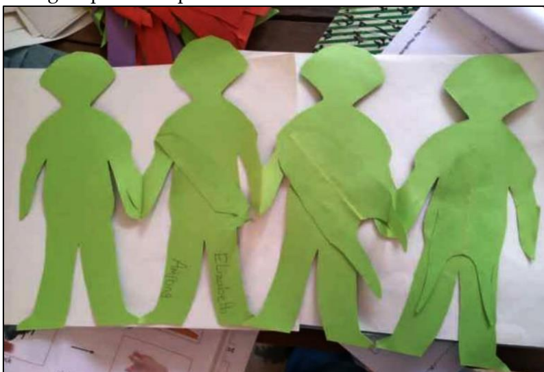
Figure 9: A papercraft Produced by a Basic Three Hearing-Impaired Pupil of Tetteh Ocloo State School for the Deaf

The greenware in Figure 8 was hand-built by a thirteen (13) year old basic six hearing-impaired girl-child, labelled as hearing-impaired pupil-respondent 2, of Tetteh Ocloo State School for the Deaf. The hearing-impaired pupil-respondent 2 potted the ware during clay moulding session facilitated by the Basic six Art specialist teacher as observed by the study. The hearing-impaired pupil-artist defined the greenware (Figure 8) as a cooking pot that was carefully decorated with incisions drawn from the shape of a garden egg.