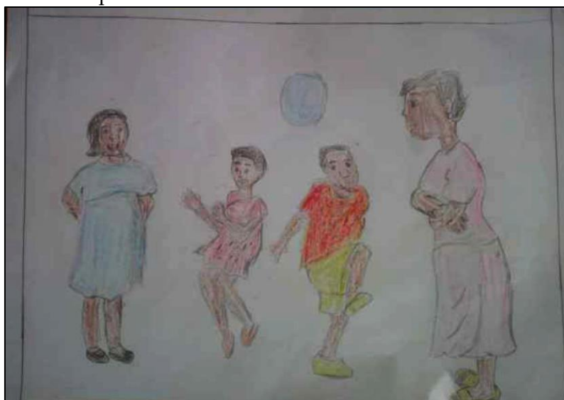
Figure 4: A Composition Produced by a Class Six Pupil of Tetteh Ocloo State School for the Deaf

her extreme love for the saleslady due to her welcoming nature and the gifts she (hearing-impaired pupil-respondent 3) always received from the said saleslady during shopping. The hearing-impaired pupil-artist further explained that the counter/table of the goods was rendered in different colours to show its various sections for different goods (food products) as observed in Figure 2. The interpretation of the composition by the pupil-artist reflects the candid narrative of her emotions, thoughts, perceptions, observations, and the inner world about happening in her immediate social environment which is consistent with the findings of previous studies on child art (Lowenfeld, 1947; 1964; Lowenfeld & Brtittain, 1987; Farokhi & Hashemi, 2011; Lowenfeld & Brtittain, 1987; Kayacan-Keser and Eren, 2015; Duku & Kemevor, 2013; Aryaf, 2016).