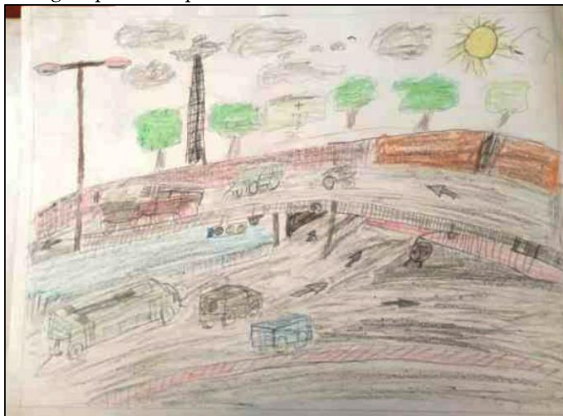
Figure 7: A Cityscape Produced by a Basic Four Hearing-Impaired Pupil of Tetteh Ocloo State School for the Deaf