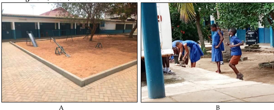
Figure 1 (A & B): School Environment of Tetteh Ocloo State School for the Deaf

(300) pupils and fifty-five (55) members of staff (34 teaching staff & 21 non-teaching staff). It is noteworthy to state that Tetteh Ocloo State School for the Deaf, through the able leadership of the current Headmaster established a vocational department in 2019 with twenty-two (22) students' enrolment. The vocational department provides training options in courses such as; carpentry, hairdressing, dressmaking, and shoemaking specifically meant for hearing impaired Junior High School leavers, school dropouts and others who have no hope or means to further their education. This is to provide skill training opportunities to interested students for the acquisition of entrepreneurial skills for self-employment and meaningful livelihood.