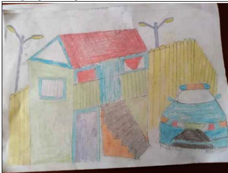
Figure 11: "Night Scene of our House" Produced by a Basic Five Hearing-Impaired Pupil of Tetteh Ocloo State School for the Deaf