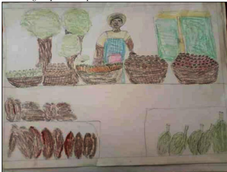
Figure 12: A composition of petty trading scene Produced by a Basic Three Hearing-Impaired Pupil of Tetteh Ocloo State School for the Deaf