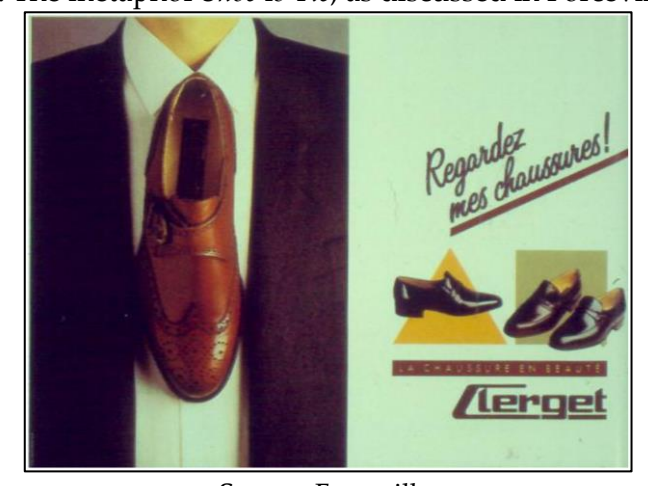
Figure 6: The metaphor Shoe Is Tie , as discussed in Forceville (1996).

According to Ick and Politi (1989), the problem is how advertisers can understand their intended meaning for the audience. Indeed, the use of metaphor always carries the risk that the person is consciously or subconsciously dealing with the characteristics with which the person communicates. This can happen if the reputation of a source domain is somehow affected after the metaphor is manipulated because then the target domain becomes vulnerable to unwanted mappings. Imagine that unexpected discovery or even just a rumor that Rembrandt's "Nachtwacht" is actually fake.