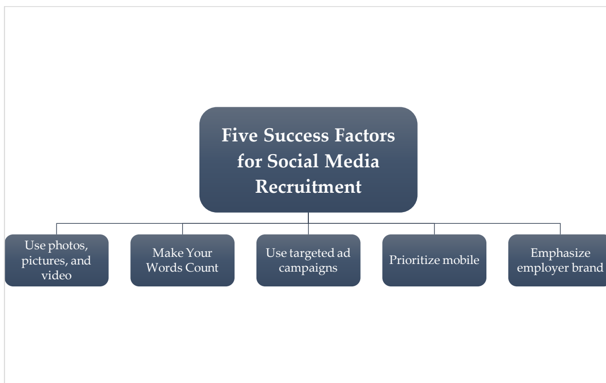
Figure 2: Jobcast's Five Success Factors for Social Media Recruitment