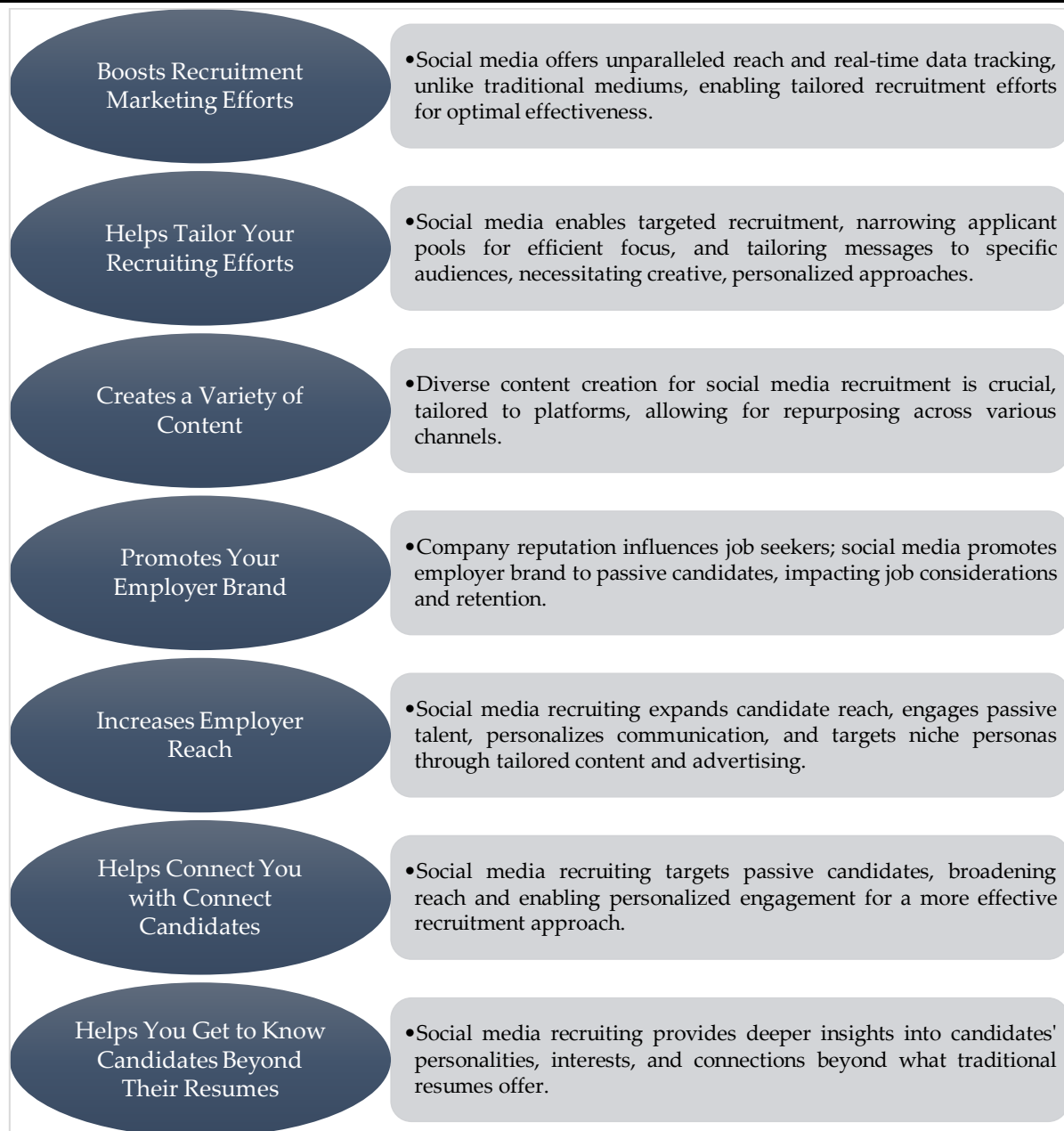
Figure 3: Seven Key Benefits of Social Media Recruiting

As a burgeoning method for employment selection, social media screening holds promise as a valuable repository of applicant information. However, its implementation comes with a myriad of legal and ethical considerations. The potential advantages and drawbacks of social media screening can vary significantly based on the specific methodologies employed (Kluemper, 2013). Relying solely on information gathered from a social networking site to make disciplinary or termination decisions poses a significant and potential pitfall for HR departments. HR professionals must exercise caution and avoid acting on such information without validation or verification from additional sources (Davison, Maraist, & Bing, 2011).