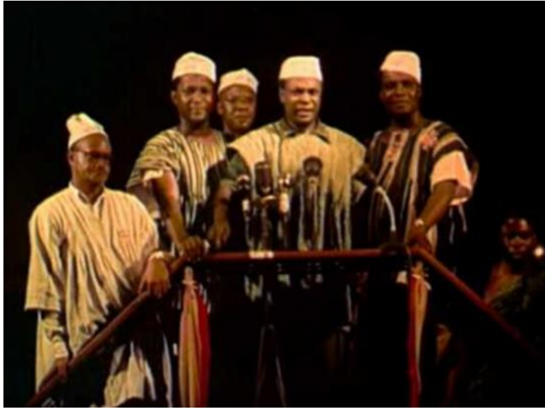
Figure 1: Kwame Nkrumah and his fellow compatriots wearing smocks during the 1957 Independence Day Declaration in Accra.