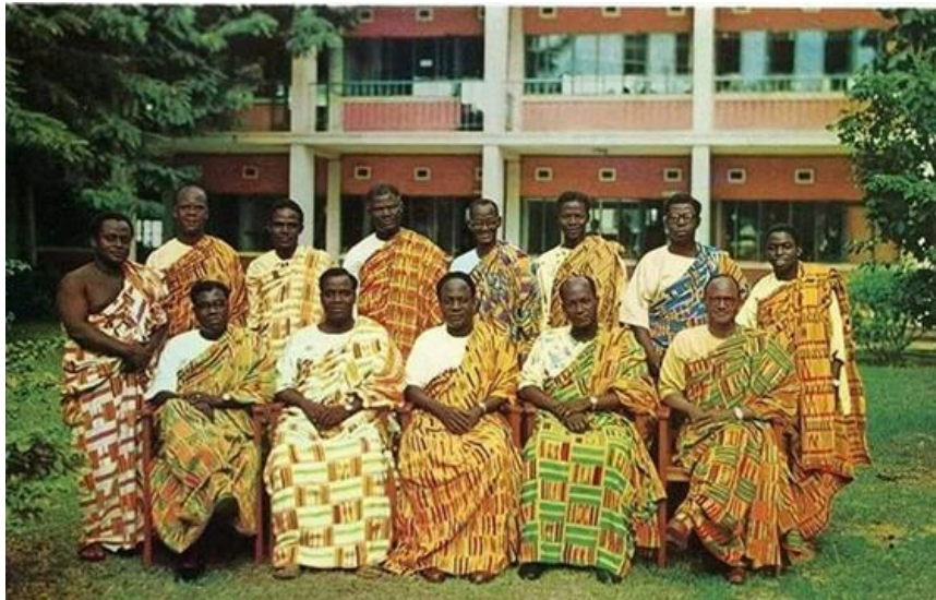
Figure 2: Dr. Kwame Nkrumah (seated in the middle of the first row) and his cabinet clad in Kente in toga style.