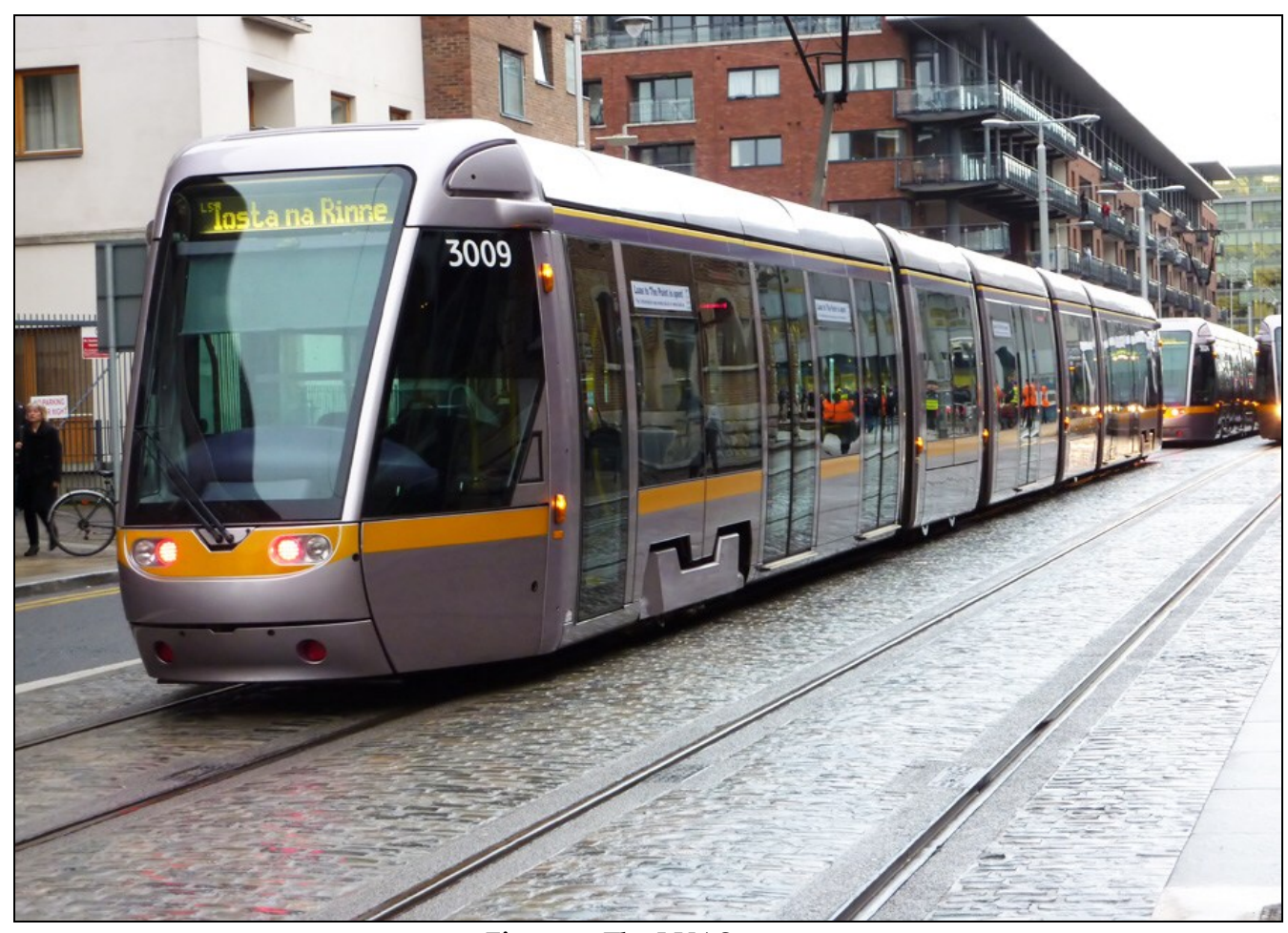
Figure 2: The LUAS